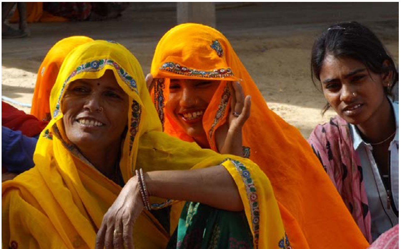
Image 1: Villagers in a small town in the state of Rajasthan are working with the Centre for Community Development to implement an irrigation scheme that aims to lessen the localized impacts of climate change.

Grassroots is an inspiring organisation with a real depth of community development experience and innovation. This includes the house of Umang , its fair trade enterprise and store. A team of hand knitters produce hundreds of fab-