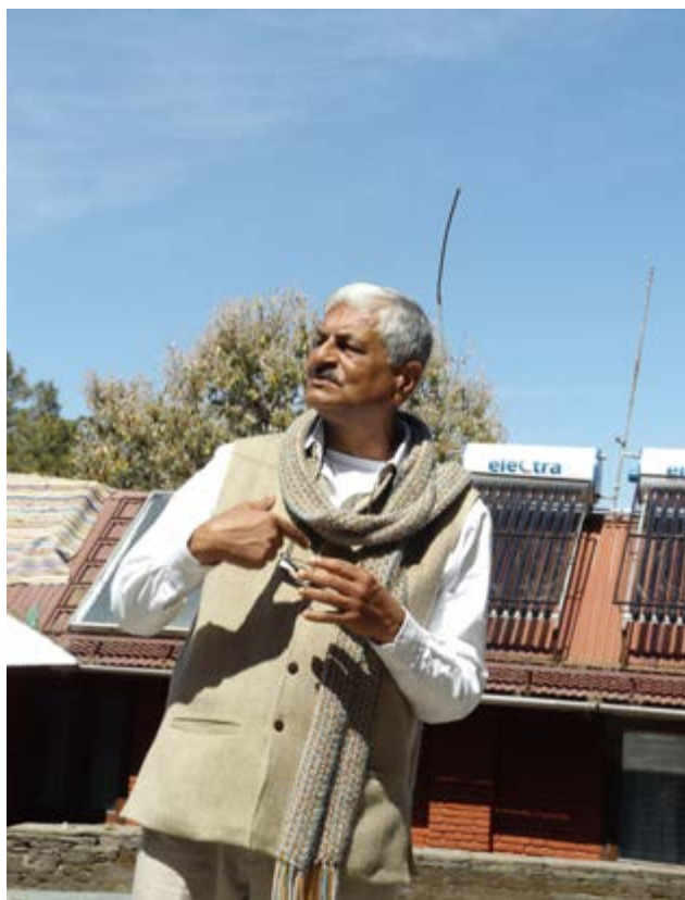
Image 2: A doctor associated with NFP organisation Aarohi, located in the Central Himalayan region of Uttarakhand, speaks to IACD conference members.

The next stop in the village was a large army regimental base. It is home to the Kumaon Regimental Community Centre where war widows have a fascinating enterprise producing Dharchuli shawls and stunning hand spun hand loomed tweed coats and jackets. Before my eyes the wool was deftly loaded into the loom and in a flurry of arms the cloth began to take shape. I am now the proud owner of a very warm one-of-a-kind tweed jacket produced with stunning skill on an ancient wooden loom. Now if only I had of had a bigger suitcase I would have gotten the coat as well!