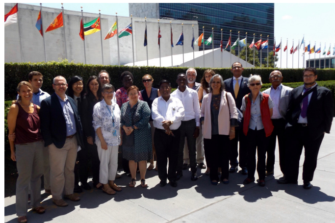
Members of IACD attend a side event to the UN high level political forum on Agenda 2030.

This event was the first tangible work arising out of IACD's support for the sustainable development goals. A four-month process of consultation with members and stakeholders culminated in a formal position statement by the IACD board pledging