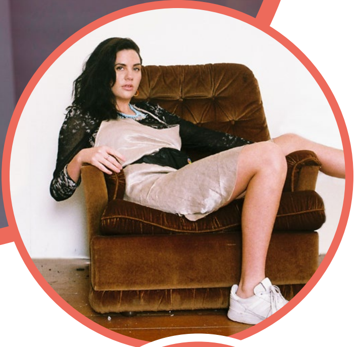
These pages: Comfort and a street-smart edge shine through in outfits from Inky Cat's Colour Me collection.

Anderson's first collection, created as part of her final-year project, was named Colour Me. She showcased the colourful, easy-wear summer range in November 2017 during a fashion show she masterminded at Auckland's Studio One – Toi Tū gallery.