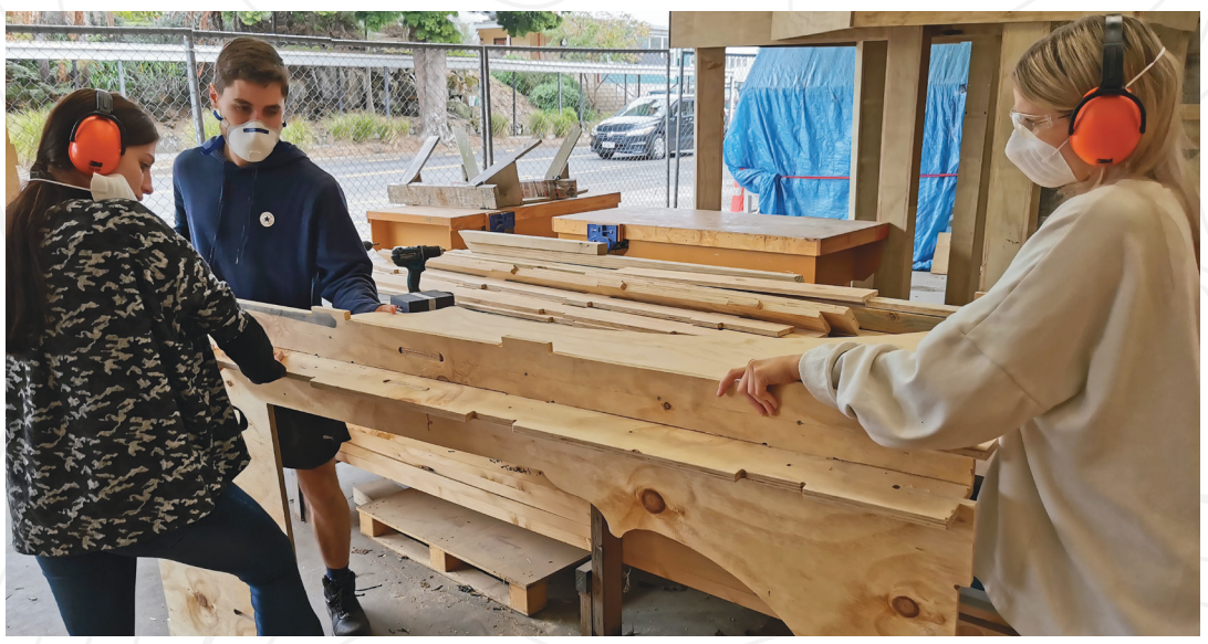
Figure 4. Architecture students assembling the pavilion.