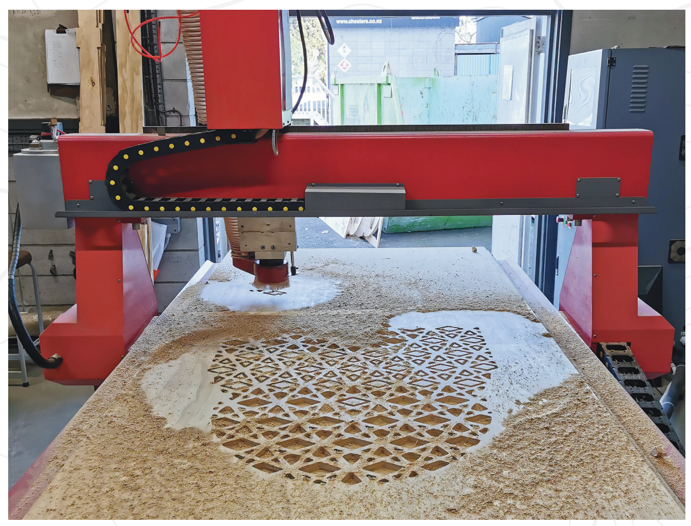
Figure 3. Fabrication of the pavilion at Unitec.

Understanding the audience is important. High-school students are different to normal architecture students and need a variety of stimuli to engage with the design process. The high-school teachers and the lecturers found: