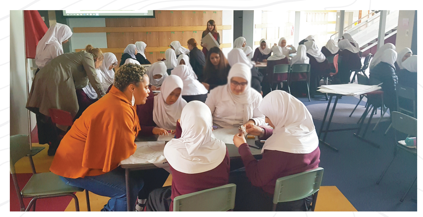
Figure 2. Workshops at Zayed College for Girls – physical modelmaking.

to safe and inclusive green and public spaces," was also considered. Once built, the proposed shelter will provide a safe place for students and a better interface with the school and its neighbourhood context. The Women in Fabrication 3.0 project was part of the international initiative Local Project Challenge, which aims to increase awareness of the SDGs and the New Urban Agenda. The project was exhibited alongside other local initiatives from 39 different countries in an online gallery.