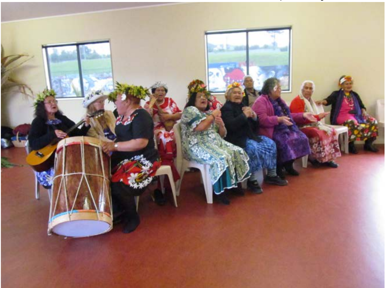
Image 20: Pacifica Mamas, Pacifica Arts Centre, Corban Estate, Auckland, NZ, 29 August 2013.

It's wonderful because you are being self-reflective and