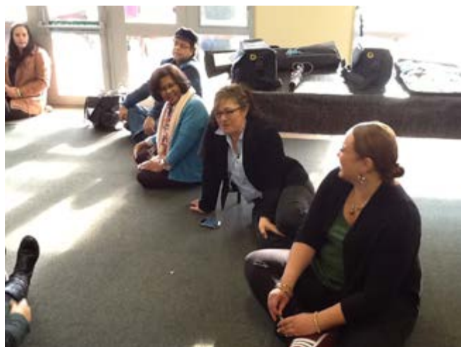
Images 18 & 19: PV Team member sharing their experiences on the second day, Pacifica Arts Centre, Corban Estate, Auckland, NZ, 30 August 2013.