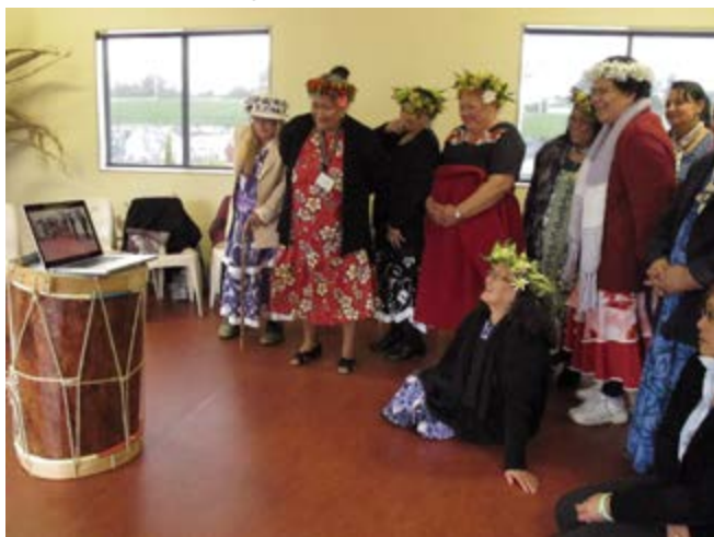
Image 14 (left): The Mamas interviewing the Mamas with PV Team looking on, Pacifica Arts Centre, Corban Estate, Auckland, NZ, 29 August 2013. Photo Courtesy of The PV Team. Image 15 (right): The Mamas reviewing footage, Pacifica Arts Centre, Corban Estate, Auckland, NZ, 29 August 2013. Photo Courtesy of The PV Team.