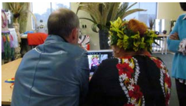
Image 16 (left): The Mamas reviewing footage, Pacifica Arts Centre, Corban Estate, Auckland, NZ, 29 August 2013. Photo Courtesy of The PV Team. Image 17 (right): PV Team member reviewing footage with Mama, Pacifica Arts Centre, Corban Estate, Auckland, NZ, 29 August 2013. Photo Courtesy of The PV Team.