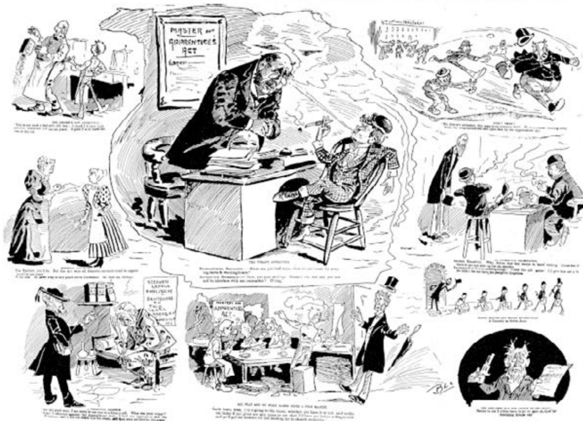
Figure 2: “What we may expect to happen when the Masters and Apprentices Bill becomes law. New Zealand Observer, Volume XV, Issue 813, 28 July 1894