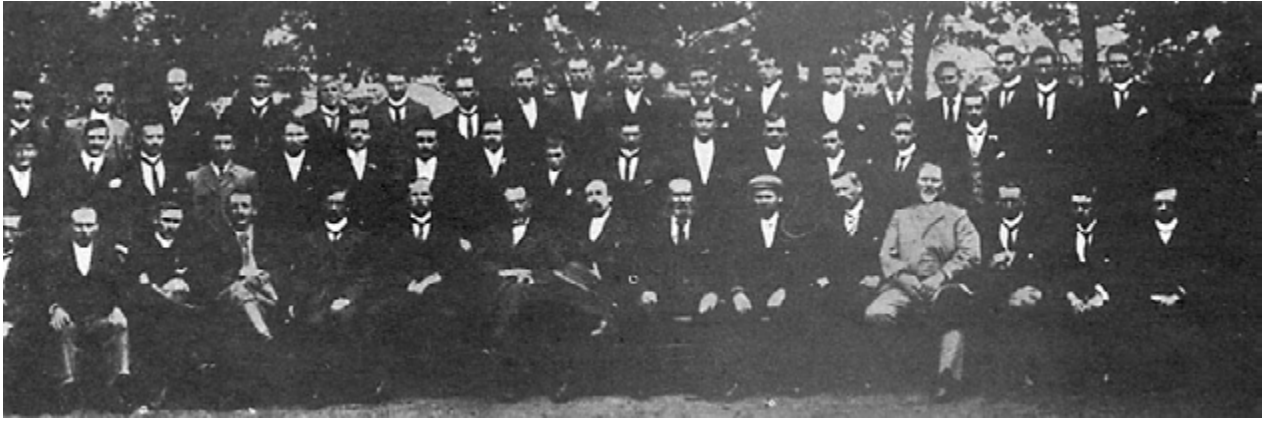
Figure 2: Members of Staff, Council Members and Students of the Waihi School of Mines, opened in 1897. Picture taken in 1902

Of the many items discussed at the conference there were continuing issues of training to meet skill requirements, the necessity and value of teaching theory and practical components in any given trade as well as how each of those components is best delivered – issues of concern still raised today.