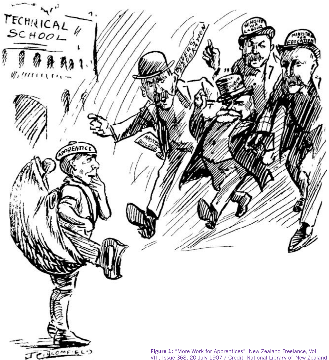
Figure 1: "More Work for Apprentices". New Zealand Freelance, Vol VIII, Issue 368, 20 July 1907