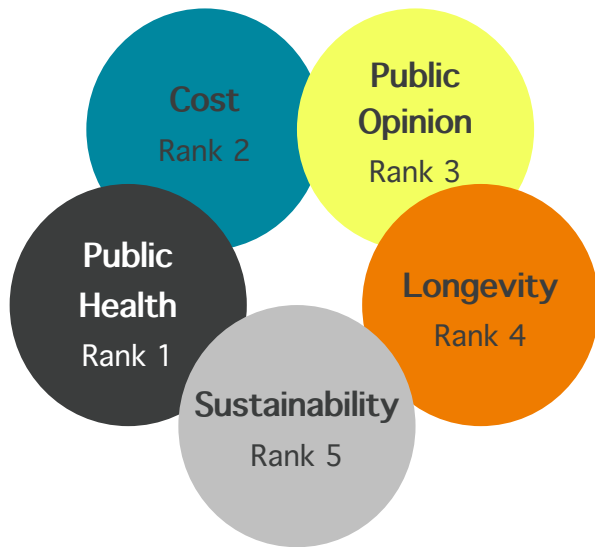
Figure 2. Factors affecting the choice of disposal route for asbestos contaminated soil and building materials

the devastating effects of the 2015 Cyclone Pam in Vanuatu has demonstrated that despite the development of an inventory for ACMs in the area, the clean-up procedure did not use this data to ensure public health and safety (S.Williams, personal communication, June 24, 2015). Further evidence from events such as the collapse of the World Trade Centre, USA in 2001, the 2011 earthquake and tsunami in Japan, and the tropical cyclone Yasi which hit Queensland, Australia in 2011, has demonstrated that asbestos contamination following these events should be considered from both a human health perspective as well as an ecological perspective. At Ground Zero, improper clean-up and communication compromised the health of people living and working there (Sheer, 2011). After natural disasters, the disposal options appear to be limited to on-site storage or landfill (Ryan et al., 2014; Asari et al., 2013).