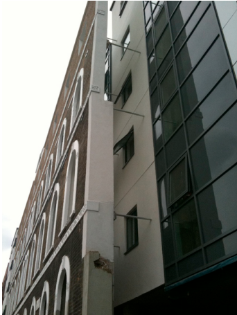
Fig. 6. Carbuncle Cup winner, Islington, London.

Finally, two unfortunate exemplars in London demonstrate the practice is alive and well elsewhere. A development in Spitalfields, East London, has been honoured as a recent case of heritage-skinning, with the sole remaining mute corner now pinned at arm's length to the new building: "If those responsible had spray-painted 'we only left this because they made us,' across one wall and 'we hate old buildings' on the other, the message would hardly be less subtle." 40 And second, the winner of the ignoble Carbuncle Cup 2013 has been awarded by The Guardian newspaper to a student housing project in Islington, London, designed by Stephen George & Partners. Here a brick front from the 1870s has been partially retained and mis-aligned clumsily onto the new housing block behind, ensuring complete blockage of natural light into some of the new student flats. Catherine Bennett writes of: