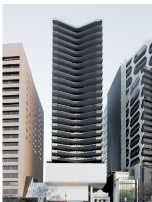
Fig. 4. FiftyAlbert development Melbourne.

to conservation demands, alongside a knowing command of the ironies of postmodernism. Further down Collins Street, the Rialto tower development retained a 10-meter frontage composed of the Rialto Building (1889) designed by William Pitt and the Winfield Building (1890) by Debro & Speight. Most recently Bates Smart's redevelopment of 171 Collins Street retains some significant depth to the Chicago-esque Auditorium Building, designed by Nahum Barnet (1912-13). Other controversial instances of façade retention and building loss in Melbourne include the recent Myer redevelopment on Lonsdale Street. Away from the city centre, in Collingwood a piece of three-storey frontage (formerly 3 buildings) was kept in front of a supermarket in the 1980s, with the historical façade masking its new body - the empty upper-storeys forming an over-scaled cornice.