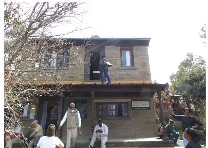
The Community Development practice exchange group stops in a village of Peora to learn about the community’s work with the Pan Himalayan Grassroots Development Foundation.

The integration of community enterprise with healthcare, education, improved livelihoods and environmental protection were strong features of all the CD organisations we visited on the exchange, where we saw sustainable development so clearly expressed we might have been looking at case studies for the UN Goals for sustainable development.