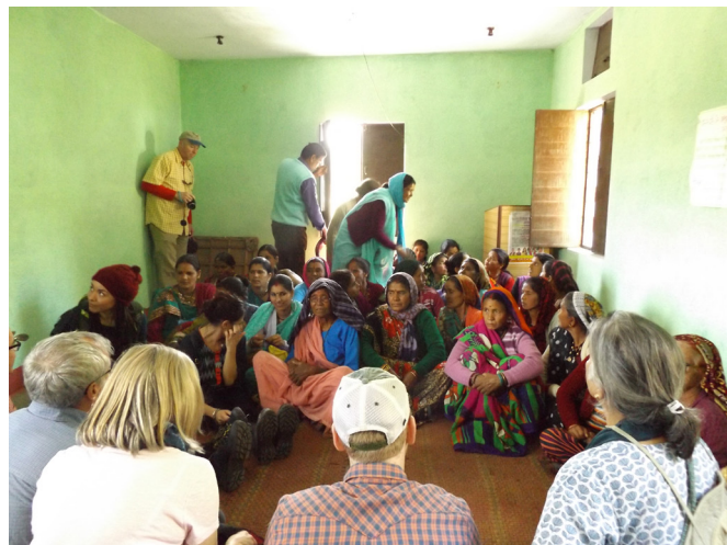
The Community Development practice exchange group stops in a village in a valley of the Uttarakhand to learn about the community’s work with the Pan Himalayan Grassroots Development Foundation.