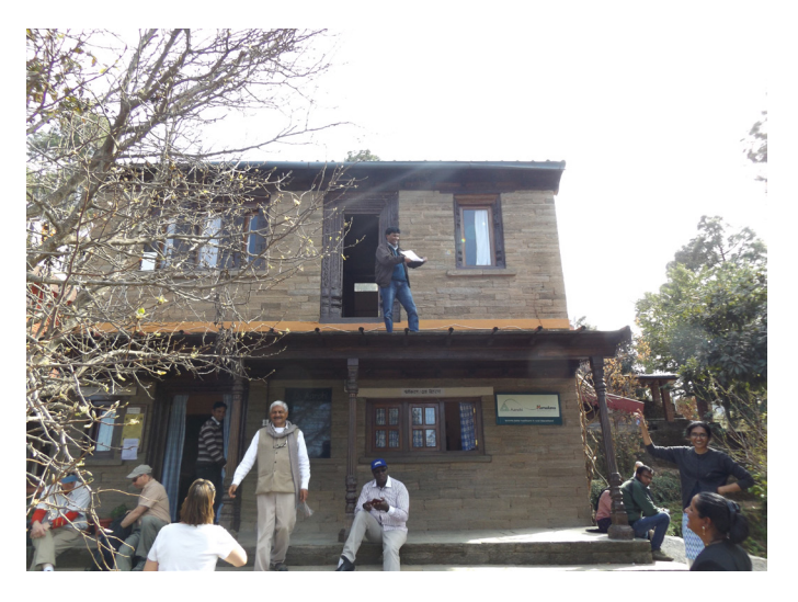
The Community Development practice exchange group stops in a village of Peora to learn about the community's work with the Pan Himalayan Grassroots Development Foundation.