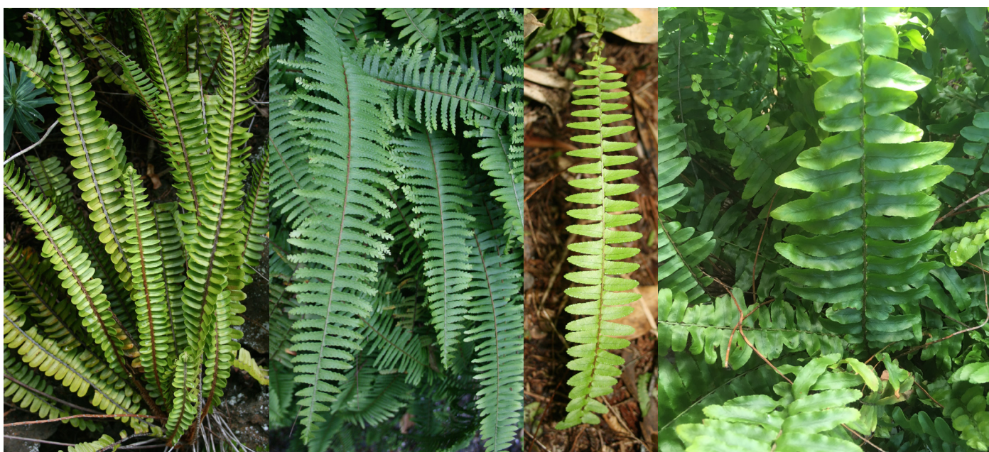
Figure 1. Nephrolepis . 1a 1b 1c 1d 1a. N. cordifolia growing on bank, Mt Albert, Auckland. 1b. Nephrolepis sp. Showing a mature frond with crests. Plant growing on road bank at Waiatarua. 1c. Frond without cresting from same population as image 1d. Nephrolepis sp. Mature frond showing slightly upturned pinnae. Plant growing on road/streamside bank Oratia.

brownii , N. flexuosa , N. exaltata and N. cordifolia , as well as fresh material of this latter species sampled from Mt Albert, Auckland. The aim was to compare general form including frond, scales, rhizome and spore morphology.