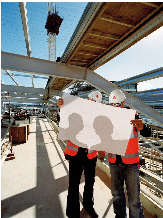
'Construction' with permission from Unitec

degrees in engineering could be used to exempt students from these preliminary examinations and thus fulfill the educational requirements needed to obtain full membership of these institutions. Special courses, including night classes, were implemented from the early 1900s at some technical colleges in New Zealand, to assist students in completing the correspondence courses provided by the British engineering institutions.