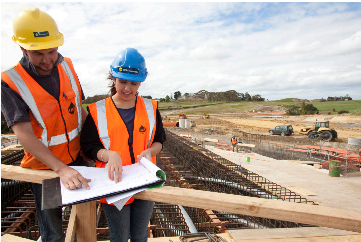
'Construction Site' with permission from Unitec

graduates with a BE (Mining) degree were practising as civil engineers.