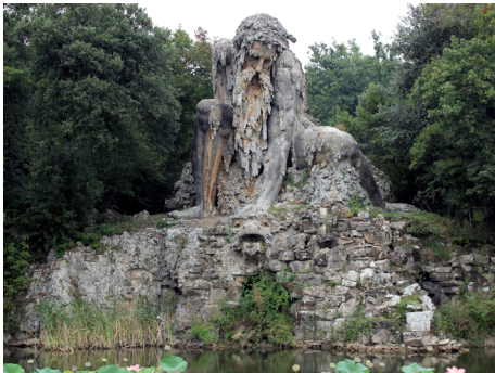
Fig. 5. Giovanni da Bologna, Appennino, 1570–80. Villa Medici (now Demidoff), Pratolino.