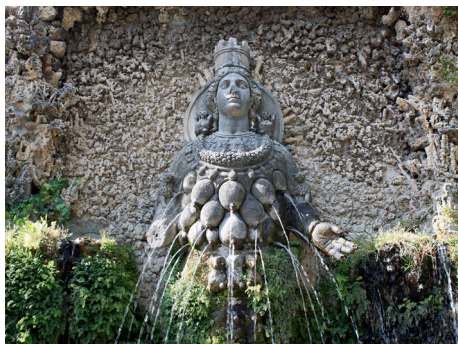
Fig. 1. Gillis van den Vliete, Goddess of Nature, 1560s, Villa d'Este, Tivoli.

The most important precedent for Nonsuch, however, is the expatriate Flemish artist Gillis van den Vliete's Goddess of Nature (1568) for the garden of the Villa d'Este, Tivoli (fig. 1). 11 Van den Vliete's figure is based on the second-century Farnese Diana now in the Museo Nazionale, Naples, and reflects the antiquarian interests of the designer of the d'Este gardens, Pirro Ligorio. 12 It is an image of the goddess as the multi-mammary Ephesian Artemis, a conflation of Classical and near Eastern themes (the cult of Artemis originated in Asia Minor); her overflowing breasts symbols of Nature's fertility. Although the fountain design in the Lumley Inventory shows Diana without the many breasts, her lower body is covered in a sheath-like skirt ornamented with the heads of animals (including lions), in a clear reminiscence of the many images of the Goddess of Nature as Artemis/Diana produced during the period.