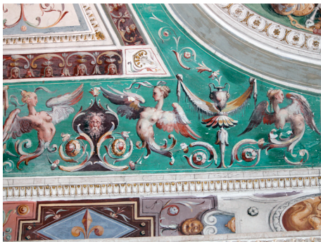
Fig. 2. Grotteschi , 16th century. Villa d'Este, Tivoli.

Vitruvius's condemnation of grotteschi is unequivocal. For him, these "monsters" were unacceptable for the simple reason that they had no basis in reality.