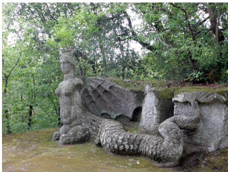
Fig. 3. Harpy, 16th century. Sacro Bosco, Bomarzo.

The harpies of the xystus in the mid to late sixteenth-century Sacro Bosco, Bomarzo, provide an example (fig. 3). In Renaissance mythography, the symbolic meaning of harpies is overwhelmingly negative. According to Natale Conti, for example, the "bodies of Harpies exactly expressed the souls of misers". For Ulisse Aldrovandi, the harpy signified rapacity, voraciousness and filthiness. 30 In art harpies are often an attribute of the deadly sin of avarice, "weak with a hunger they cannot appease". 31 In both cases, they are creatures to be feared.